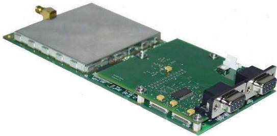
Tiamis-800 transceiver with Option 1102 - interface board